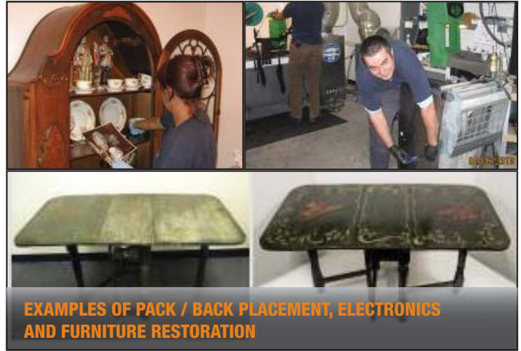
EXAMPLES OF PACK / BACK PLACEMENT, ELECTRONICS AND FURNITURE RESTORATION