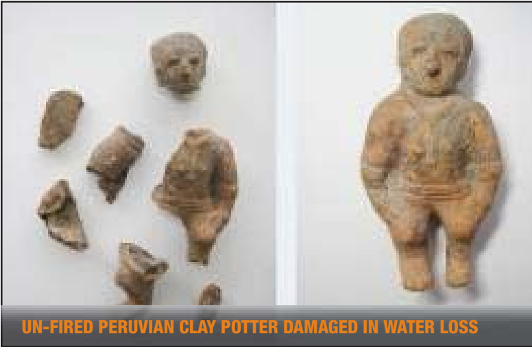
UN-FIRED PERUVIAN CLAY POTTER DAMAGED IN WATER LOSS