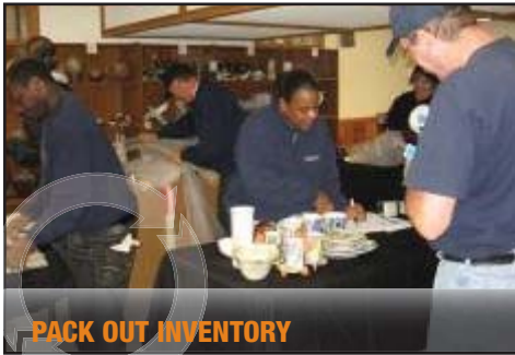
PACK OUT INVENTORY